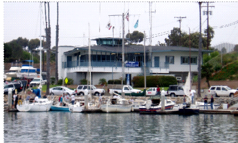
Let The Harbor Department and the City Fathers know how you feel!

The Small Craft Harbor District's Harbor Precise Plan that details the harbor's land-use plan delineates the number of Slip Renter Parking spaces necessary for each gangway's usage, how close they must be and other accessibility issues. It establishes and requires a set ratio of parking spaces per slip numbers. The plan specifically requires \frac{3}{4} of a parking space per slip or 75 parking spaces per 100 slips. The required parking ratio must be within 300 feet of the gangway it serves. The Oceanside Small Craft Harbor District is expected to be in compliance.